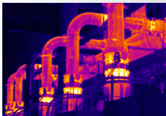
MultiSharp Focus, available on the RSE300 and RSE600 Infrared Cameras