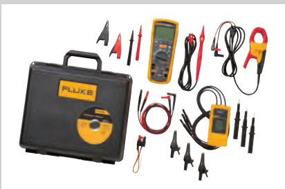
MDT Advanced Motor and Drive Troubleshooting Kit