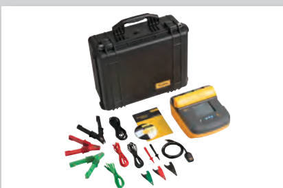
Fluke 1550C Insulation Resistance Tester Kit