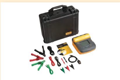
Fluke 1555 Insulation Resistance Tester Kit