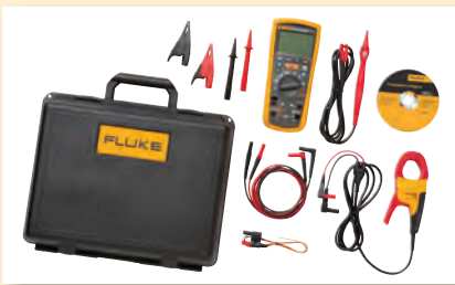
Fluke 1587 FC ET Advanced Electrical Troubleshooting Kit