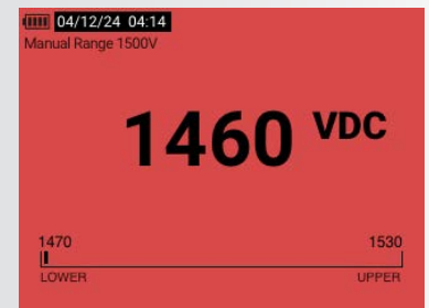
Limit gauge - outside of range