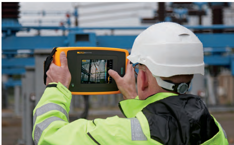
Image taken of the ii910 Precision Acoustic Imager detecting partial discharge in a high voltage application.