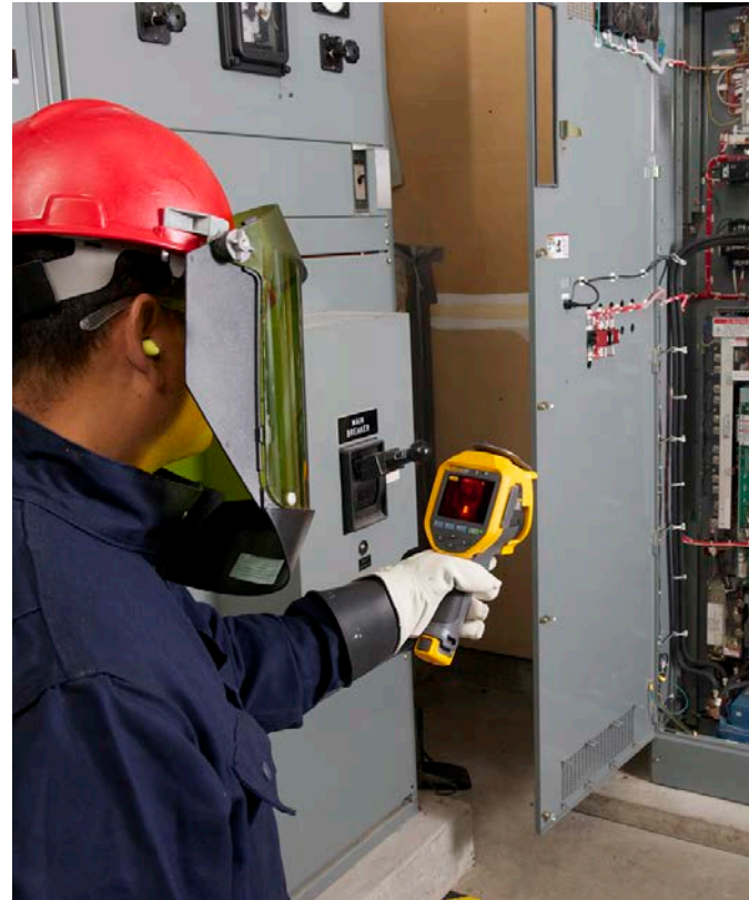
When scanning a live electrical panel, wear appropriate 70E personal protective equipment for arc flash and stand at least four feet away.

Objects that have high emissivity emit thermal energy well and are not usually very reflective. Materials that have low emissivity are usually fairly reflective and do not emit thermal energy well. This can cause confusion and incorrect analysis of the situation if you are not careful. A thermal imager can only accurately calculate the surface temperature of an object