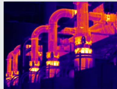
MultiSharp Focus, available on the Ti450 PRO and Ti480 PRO